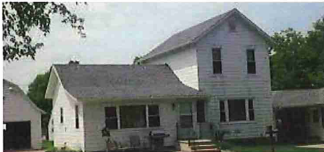
Pin 0390-03-27-231-011-0 Photo